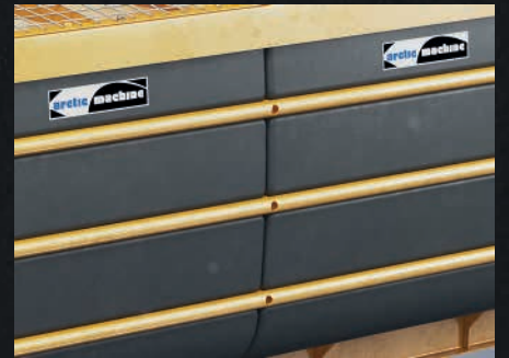
Optimised solution capacity.