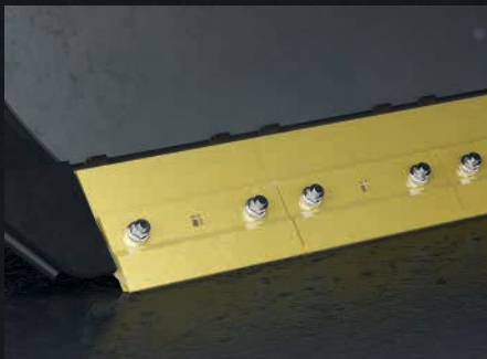
AM iFLEX™ multi-part flexible-blade structure