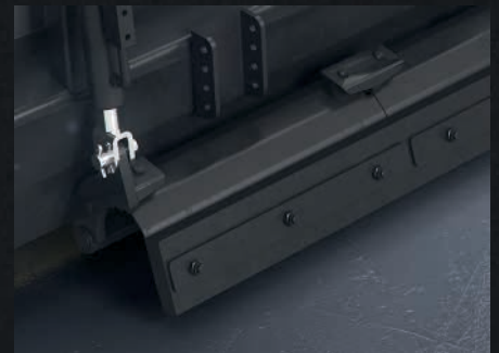
The option of being fitted with a multi-part double blade