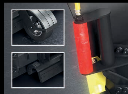
A wide range of equipment options, to meet all your needs