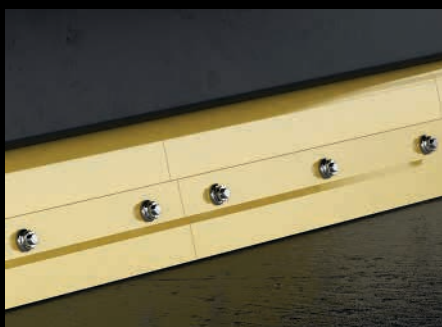
Multi-part AM iFLEX™ flexible-blade structure