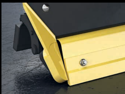
Replaceable wear blocks