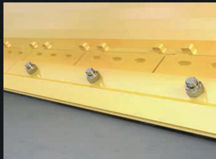
Multi-part blade, for excellent results