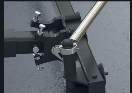
Mechanical safety device