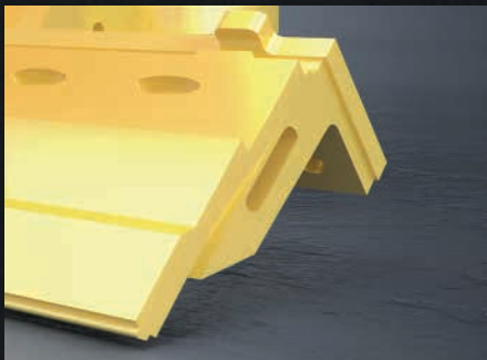
Silent AM iFLEX™ flexible-blade structure