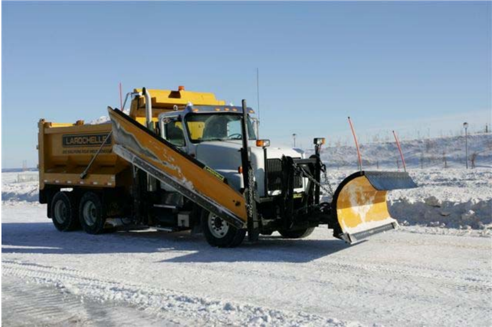
Canadian road maintenance unit presented at the work show.