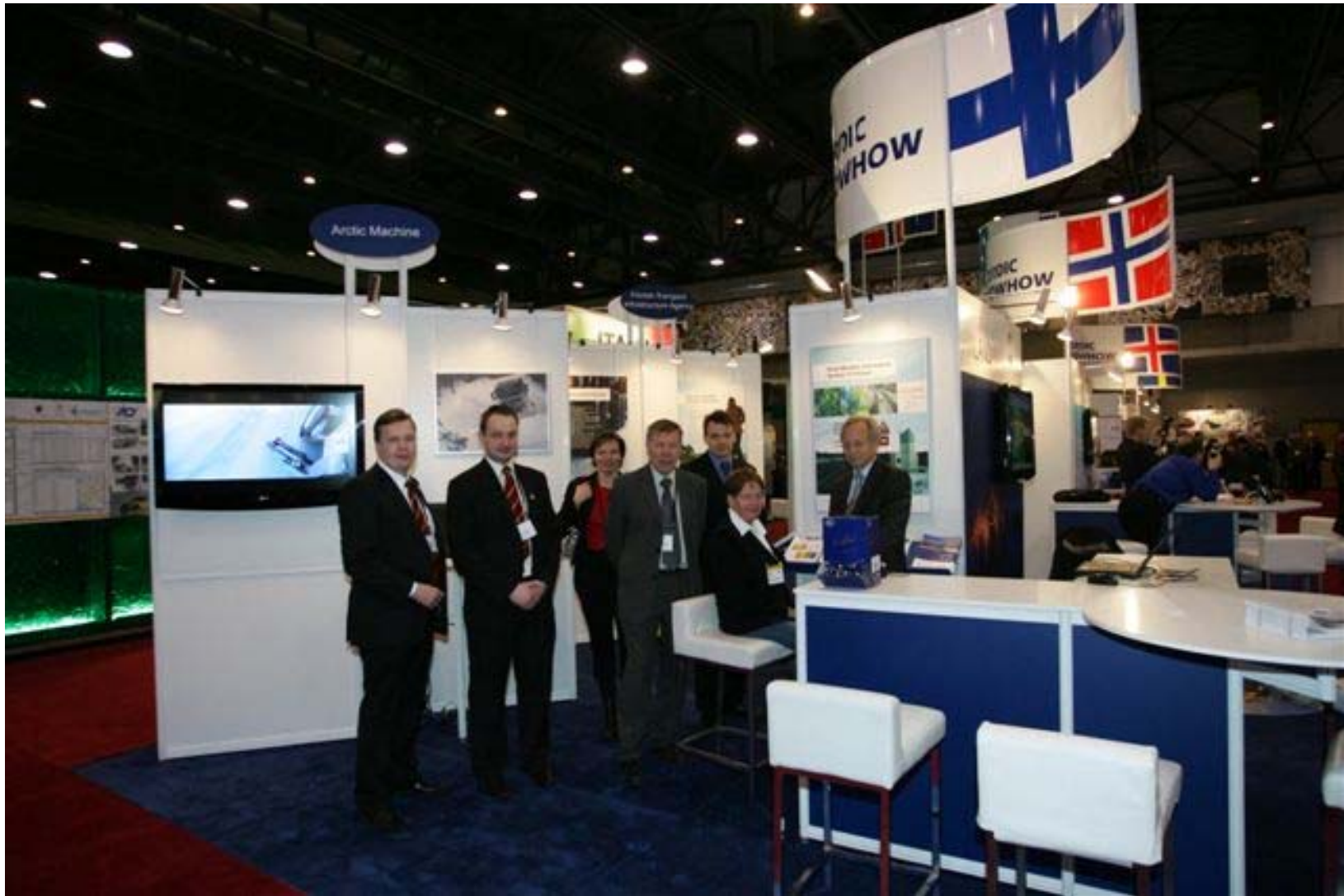
The representatives of the Finnish department at the World Road Congress.